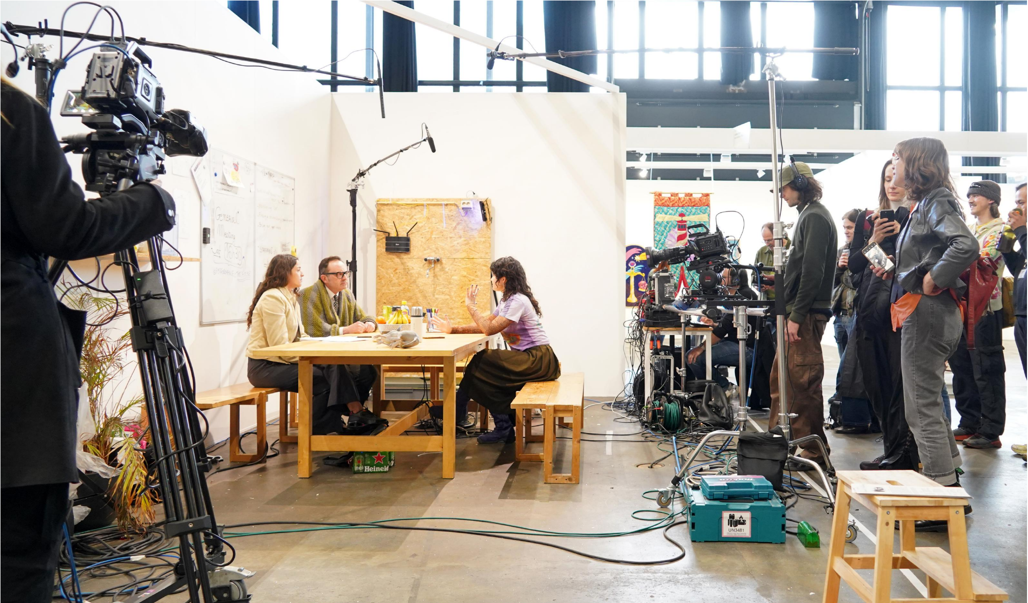
Intersections, Art Rotterdam 2025, Rotterdam Ahoy